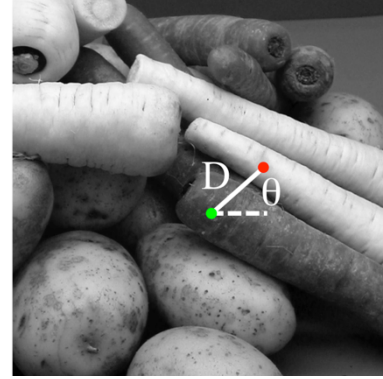
Fig. 2. Participants judged whether the point in the scene indicated by the red or green dot was the closer; the distance between the points ( D ) and the direction of their separation ( \theta ) are indicated.

A further complication in trying to understand how binocular cues contribute to depth perception is that the results that we obtain from sparse stimuli do not readily generate to more complex scenes. A striking demonstration of this is the fact that simple ordinal depth judgments are more reliable for individual points in empty space than they are for the same points lying on objects defined by multiple cues [13]. The deterioration in performance in this study occurred despite the fact that the surfaces contained much more information about the