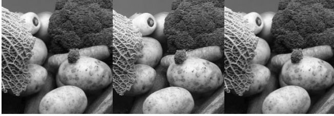
Fig. 1. An example of the stereoscopic images used, arranged for uncrossed (left and centre) or crossed (centre and right) viewing.

sign and magnitude of disparity, and knowledge of the viewing geometry [5].